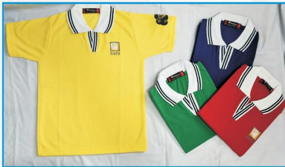
Name of Houses : Wind -Yellow, Water - Blue Fire - Red, Earth - Green