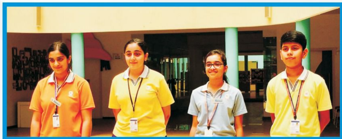
DRSIS House T-Shirts