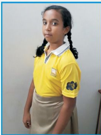
Grade : I - X